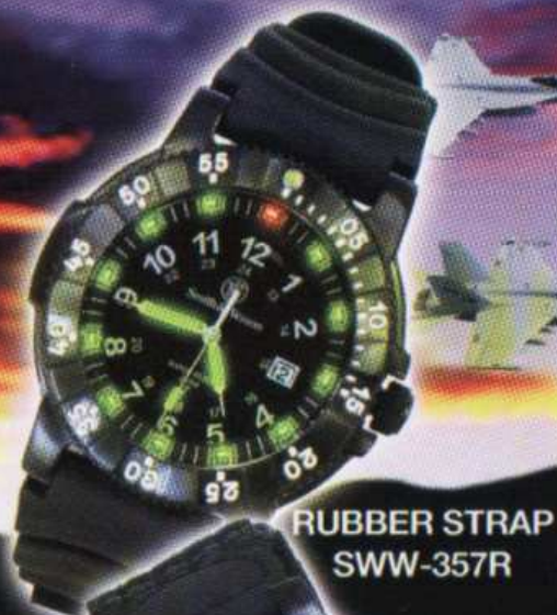
RUBBER STRAP SWW-357R